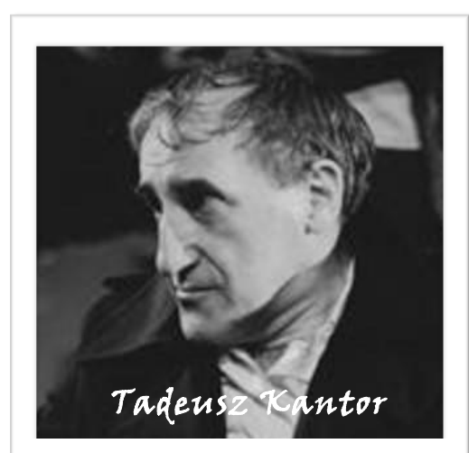
Painter, assemble artist, theatre director known from his experimental performances