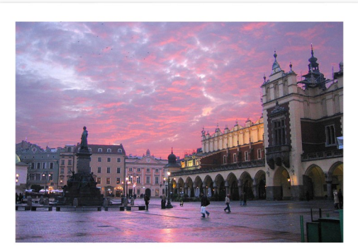
Cracow - a former capitol, city of Renaissance architecture, poetry, music and theater

Biskupin - the ancient settlement was built on a marshy island, most probably in 738 B.C.